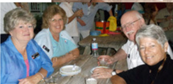
Approx. 100 members enjoyed time getting to know one another, talking about their squadron's activities, and sharing boating stories during the Commander's Reception.